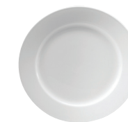
Plates R422 118 (6½"/ 15.5 cm), 3 doz R422 123 (7"/ 17.5 cm), 3 doz R422 132 (8½"/ 21.1 cm), 3 doz R422 143 (9½"/ 23.8 cm), 2 doz R422 149 (10½"/ 25.5 cm), 1 doz R422 155 (11"/ 27.9 cm), 1 doz R422 162 (11½"/ 30.1 cm), 1 doz R422 167 (12½"/ 31.7 cm), 1 doz