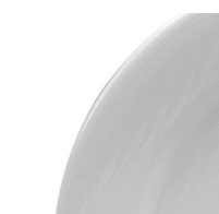
Caressa (8000) (Continued on next page)