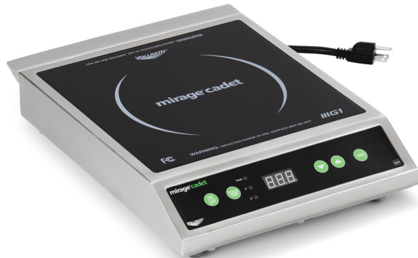
Mirage® Cadet 59300 Countertop Induction Range