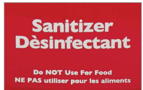
Trilingual Labeling aids in employee training (English-Spanish on front, English-French on back panel)