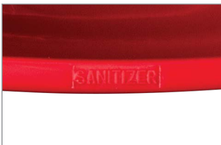
Raised Lettering ensures meeting health code guidelines