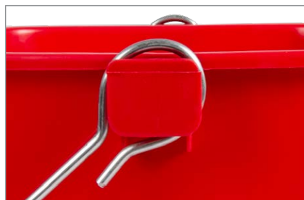
Durable Handle Design prevents broken or lost handle