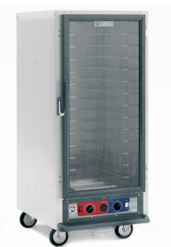
3/4 Height Fixed Slides Combination Module