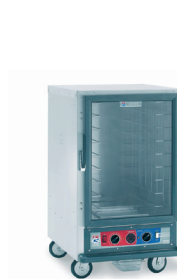
1/2 Height Fixed Slides Combination Module