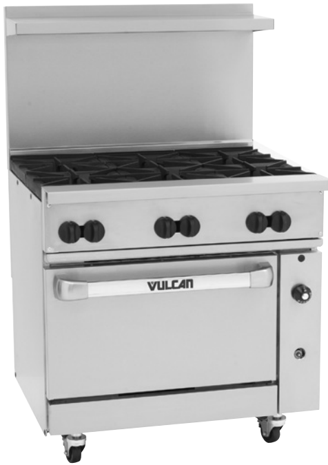
Model 36S-6BN (shown with optional casters)