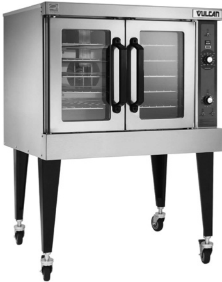
Model VC4GD Shown on optional casters