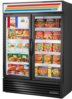
Optional Black Exterior