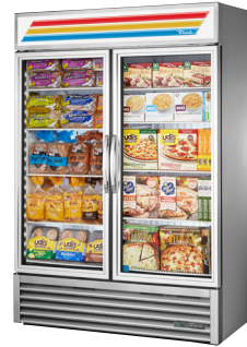
Optional Stainless Exterior