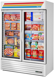
Standard White Exterior