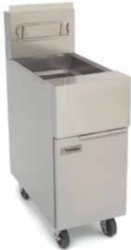
GF40 Shown with optional casters