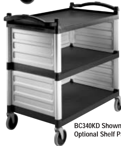
BC340KD Shown with Optional Shelf Panel Sets