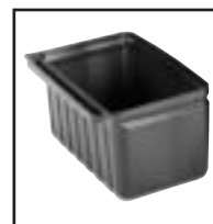
2.5 Gallon (9,5 L) Silverware Holder