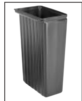
8 Gallon (30,3 L) Trash Container