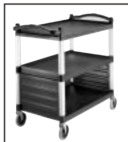
Shelf Panel Set (includes 1 Side Panel and 2 End Panels)